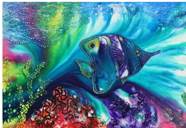
Work made by Workshop participants!